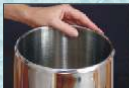
Inside of boiling chamber

Choice of exterior finish : White baked enamel on steel plate or polished stainless steel. Both have a stainless steel boiling chamber and cooling coil.